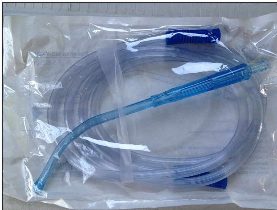
A package with a yankauer suction tip and tubing